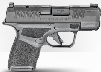
HELLCAT® 3" MICRO-COMPACT OSP™ HC9319BOSP | 9MM

PURCHASE EACH ONE OF THESE POPULAR SPRINGFIELD FIREARMS FOR YOUR RANGE & RECEIVE A 30% DISCOUNT