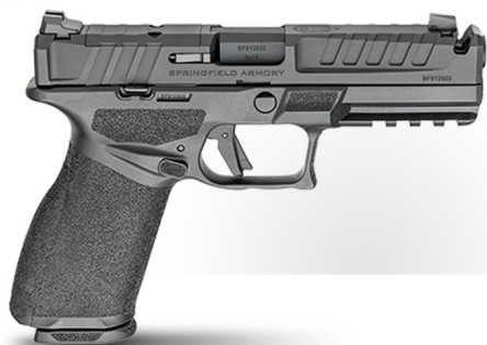
ECHELON™ 4.5F COMP EC9459B-U-COMP | 9MM