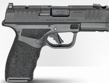
HELLCAT® PRO COMP OSP™ HC9379BOSP-COMP | 9MM