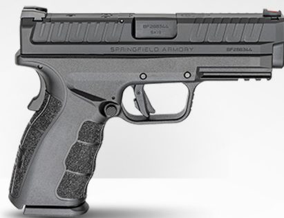
XD® MOD.3 OSP™ XDDG9101BOSP | 9MM