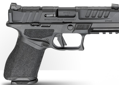
ECHELON™ 4.0C EC9409B-U | 9MM

PURCHASE THE 5 PISTOLS ABOVE PLUS 5 ADDITIONAL & RECEIVE A 35% DISCOUNT